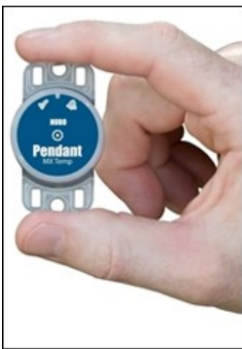
Figure 1: HOBOMX2201 Temperature Data Logger

You will need to follow the manufacturer’s instructions for the initial setup of the data logger before deployment. This includes the installation of the HOBOMX2201 Connect App on either a computer or cell phone. You may also find it helpful to use HOBOLink and HOBOWare to process and visualize data.