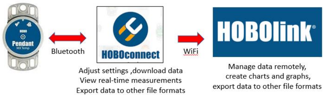
Figure 2: HOBOLink

data that has been acquired. The HOBOLink website can be used for more extensive data visualization and management, as well as exporting data to different file types for analysis with other software packages.